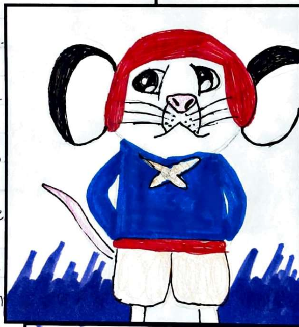
Despereaux the Brave

illegal soup and alerts the king who dismisses the concern. They live happily