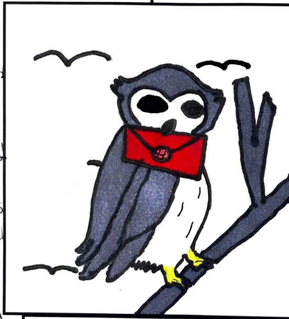
Hedwig w/ the Hogwarts Letter

Harry, Ron and Hermione are such a good team! When they come together, only accomplishments, danger, and crazy adventures come along!